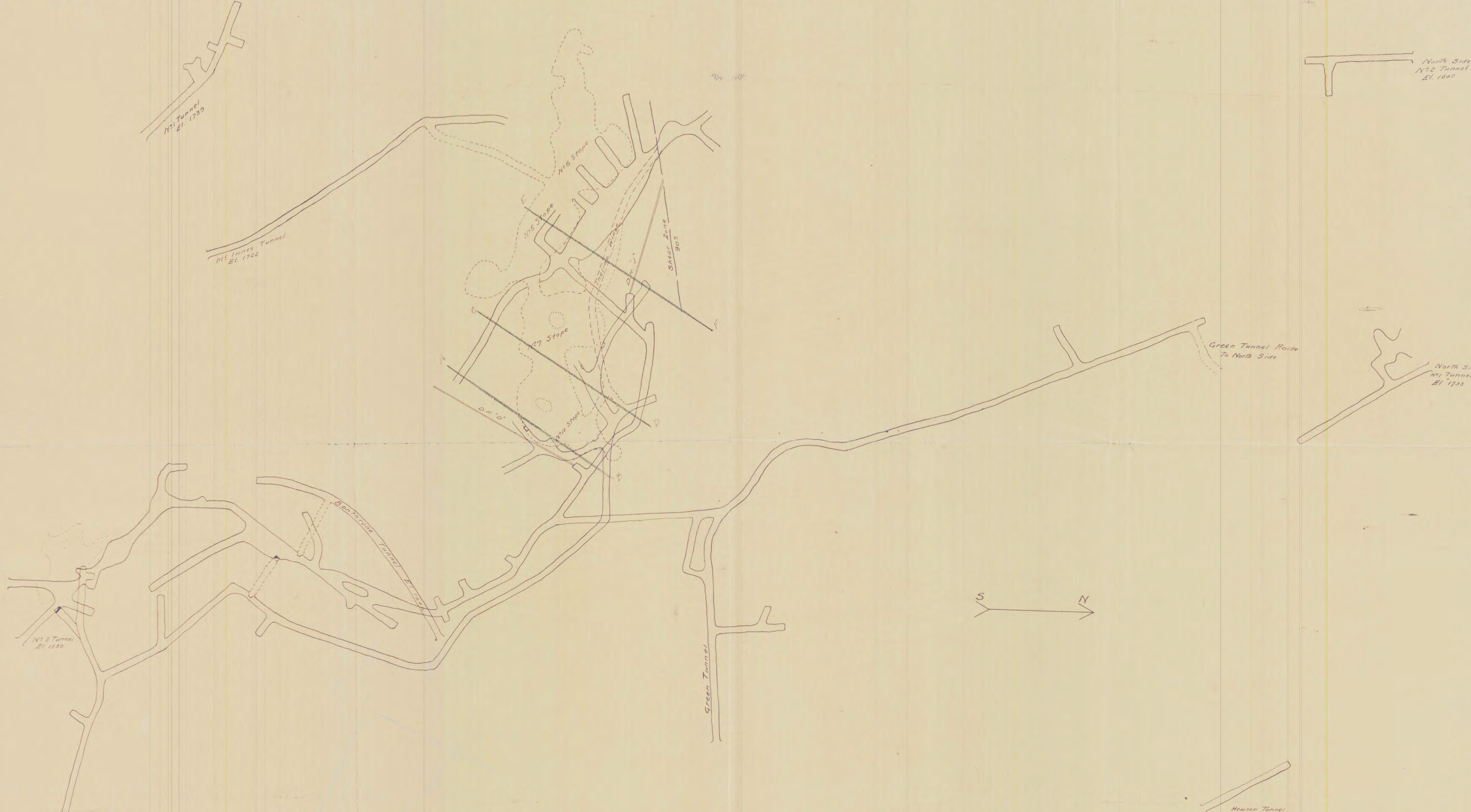
PLAN OF THE SIDNEY INLET WORKINGS After C. C. Cushwa Scale, 1 in = 40 ft