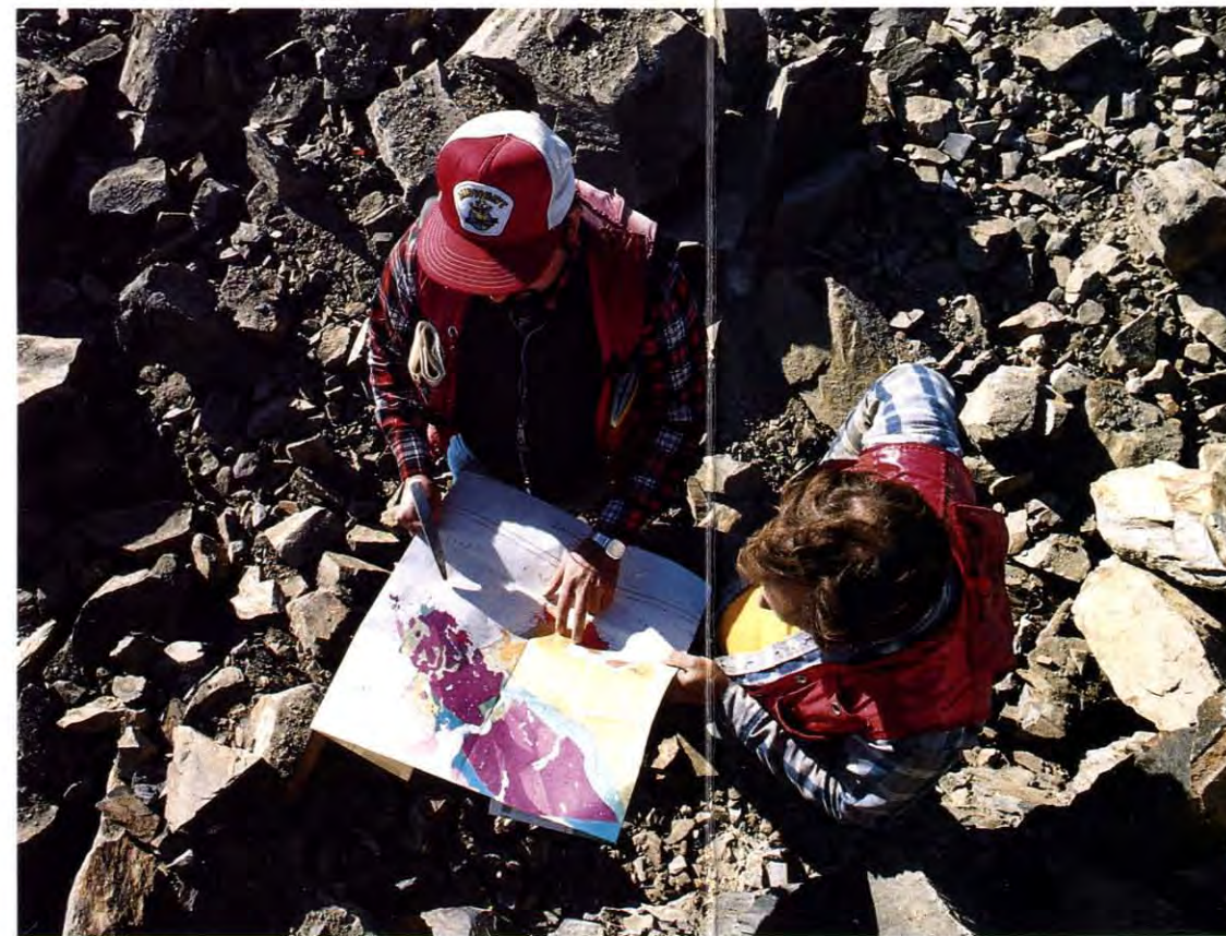
A team of Valentine Gold geologists are actively mapping trenches for bulk sampling.

Because the free gold occurs predominantly in spectacular aggregate masses, Valentine Gold Corporation commissioned Bacon Donaldson & Associates to design and build a 20 ton per day bulk sampling plant to provide a more accurate estimate of average gold content. The plant has been completed and test mining of the Discovery Zone has begun. Concurrently, basic exploration of the entire property continues to show positive results. Several areas, each longer than the 1,000 foot Discovery Zone, appear to have even greater potential.