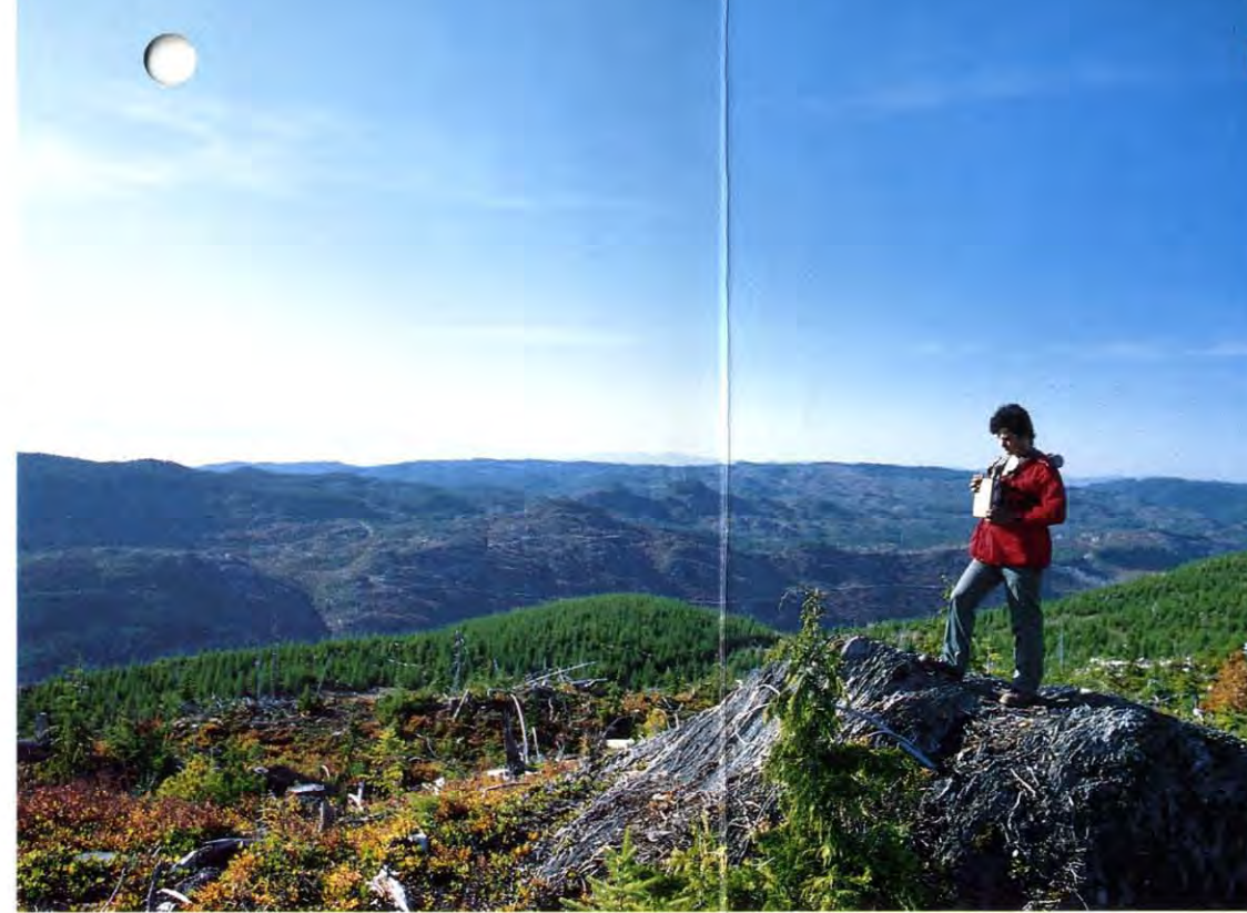
Geophysical surveying of the fifty square mile Valentine Mountain Property.