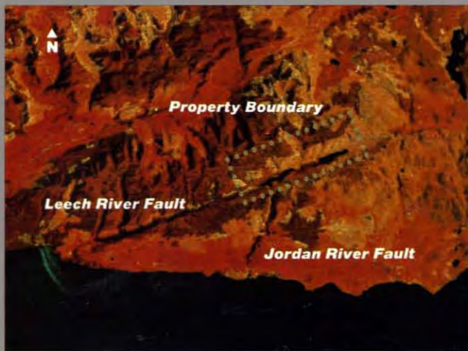
Satellite image of Valentine Mountain Property area.