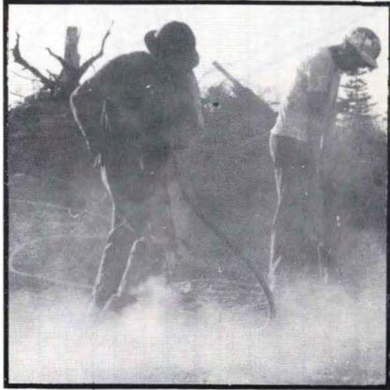
Exploration drilling on Valentine Mountain