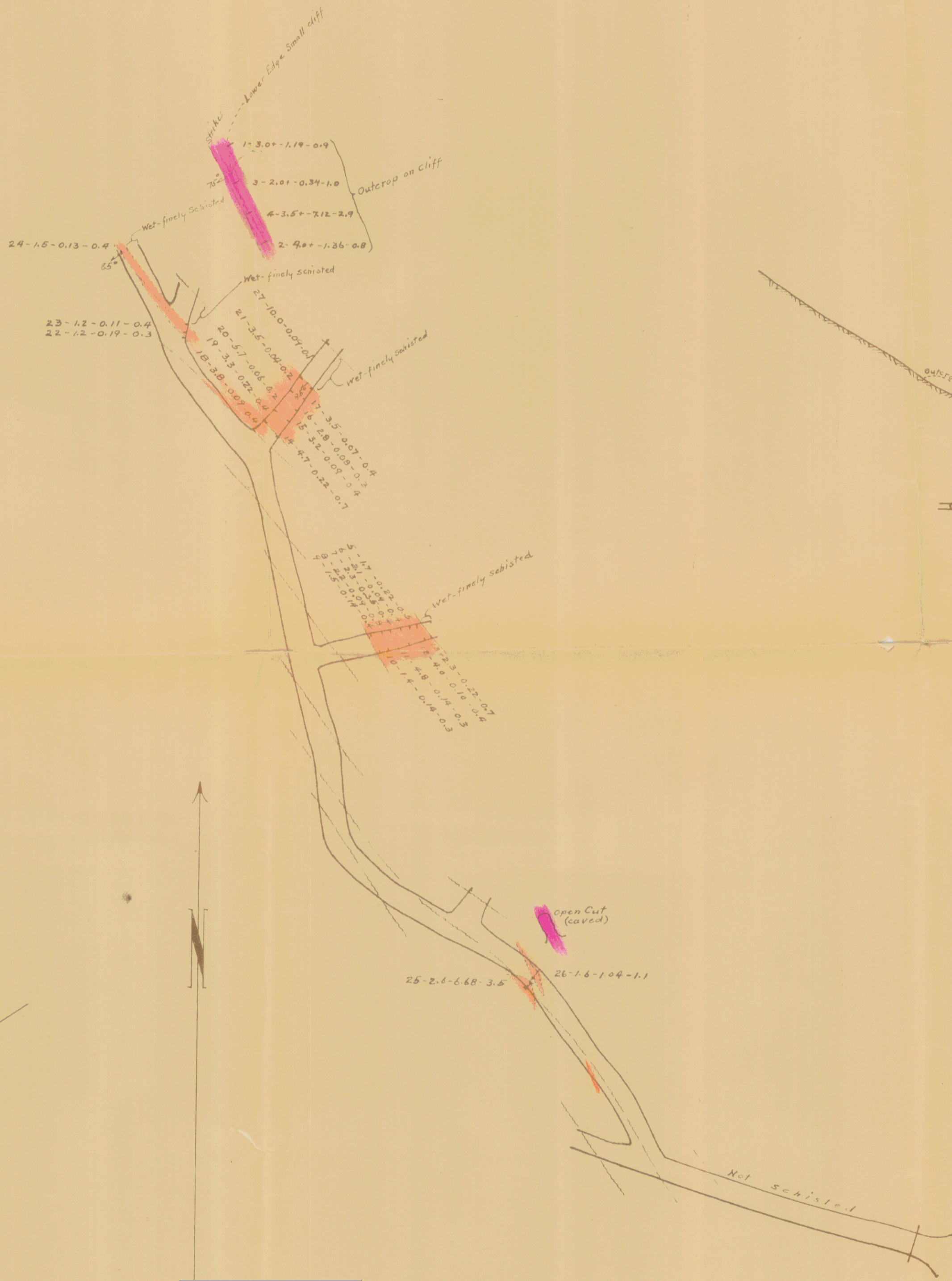
TUNNEL AND ASSAYS SCALE: 1" = 20'