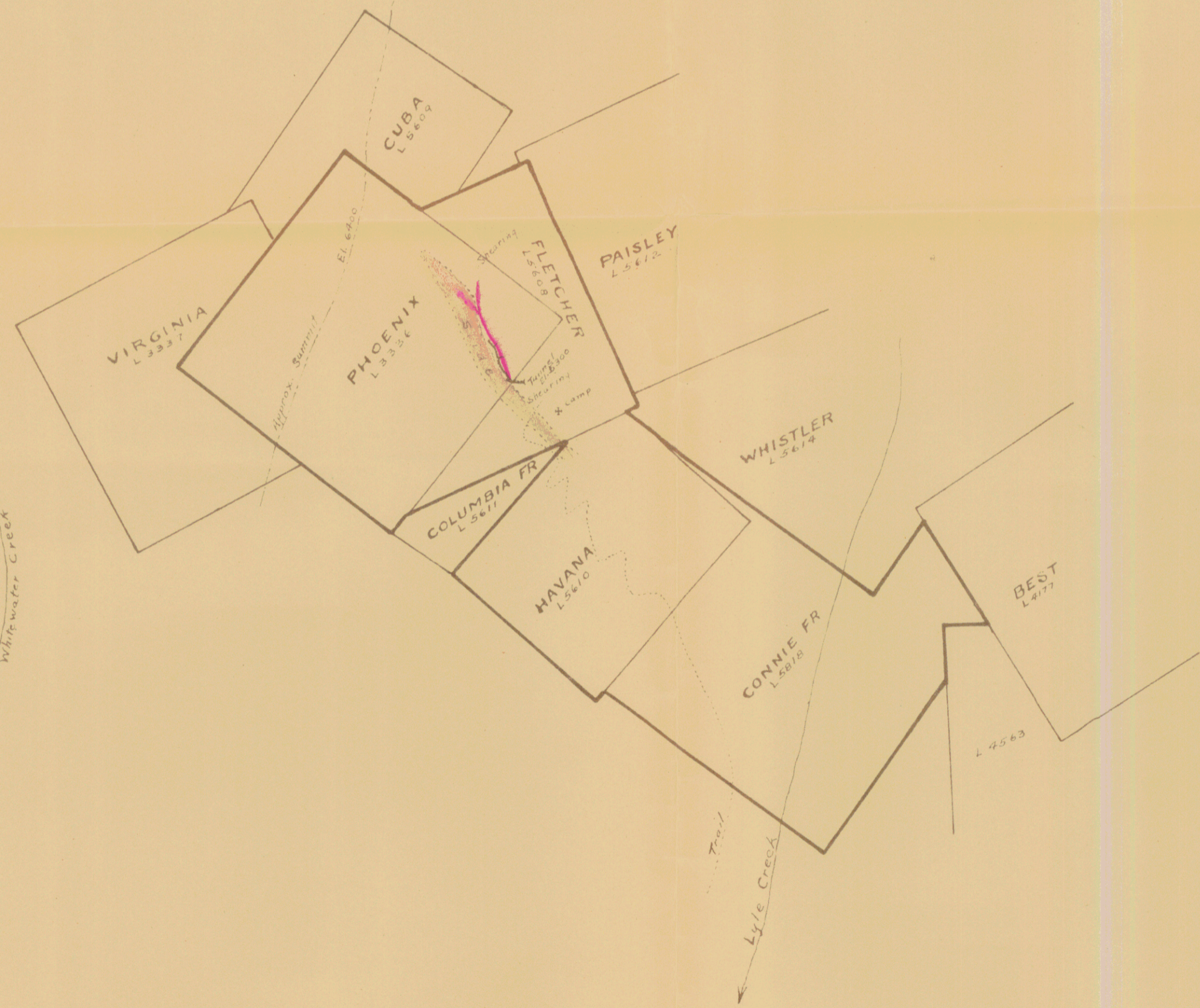
CLAIM MAP SCALE: 1" = 600'