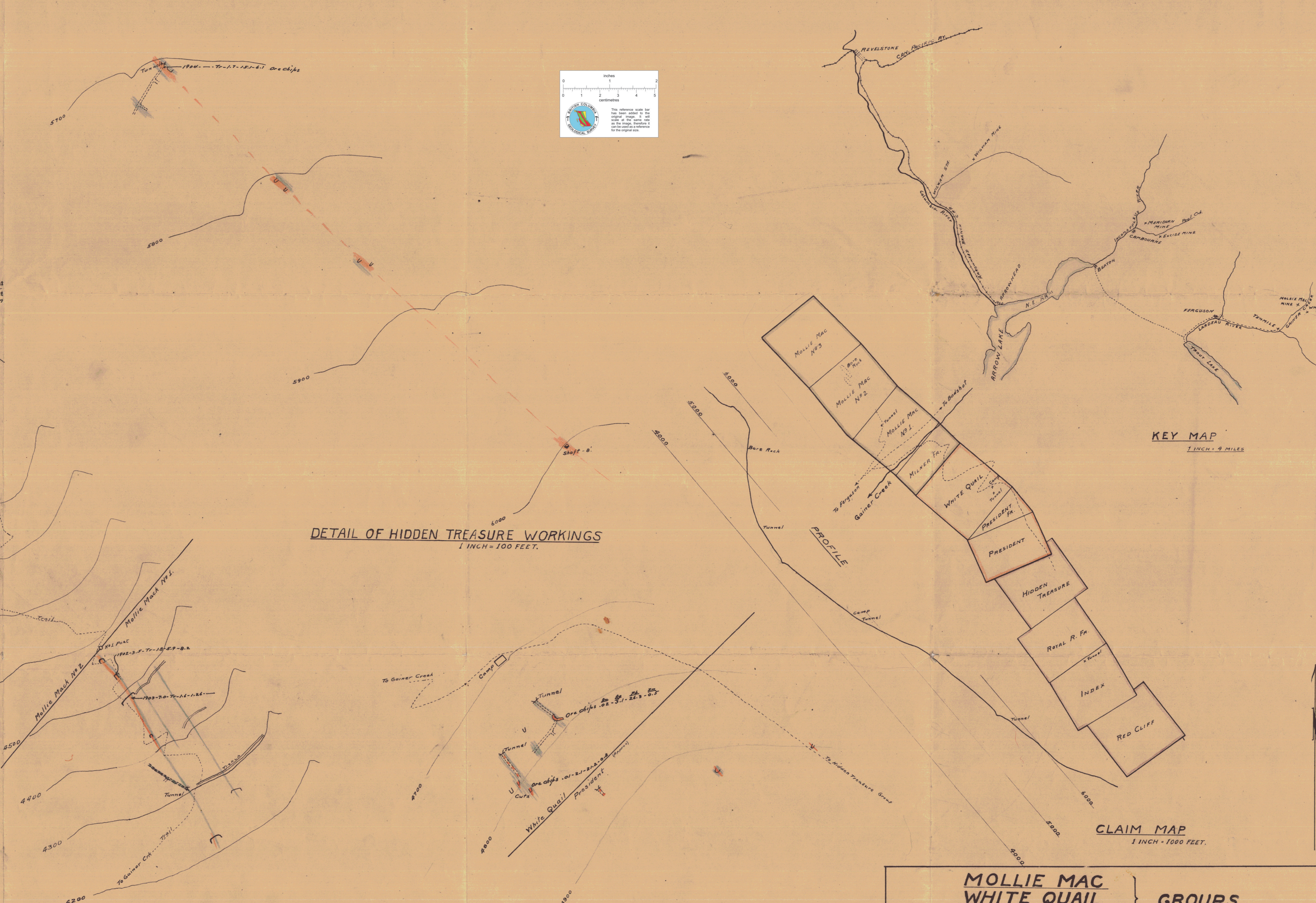
DETAIL OF HIDDEN TREASURE WORKINGS 1 INCH = 100 FEET.