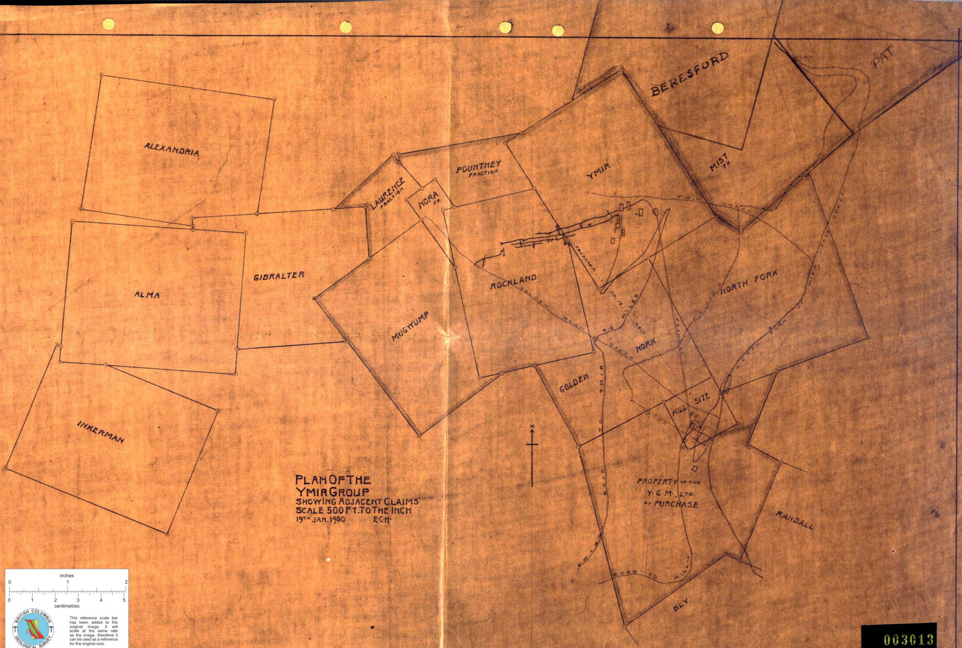
PLAN OF THE YMIR GROUP SHOWING ADJACENT CLAIMS SCALE 500 FT. TO THE INCH 19 TH JAN. 1900 ECH