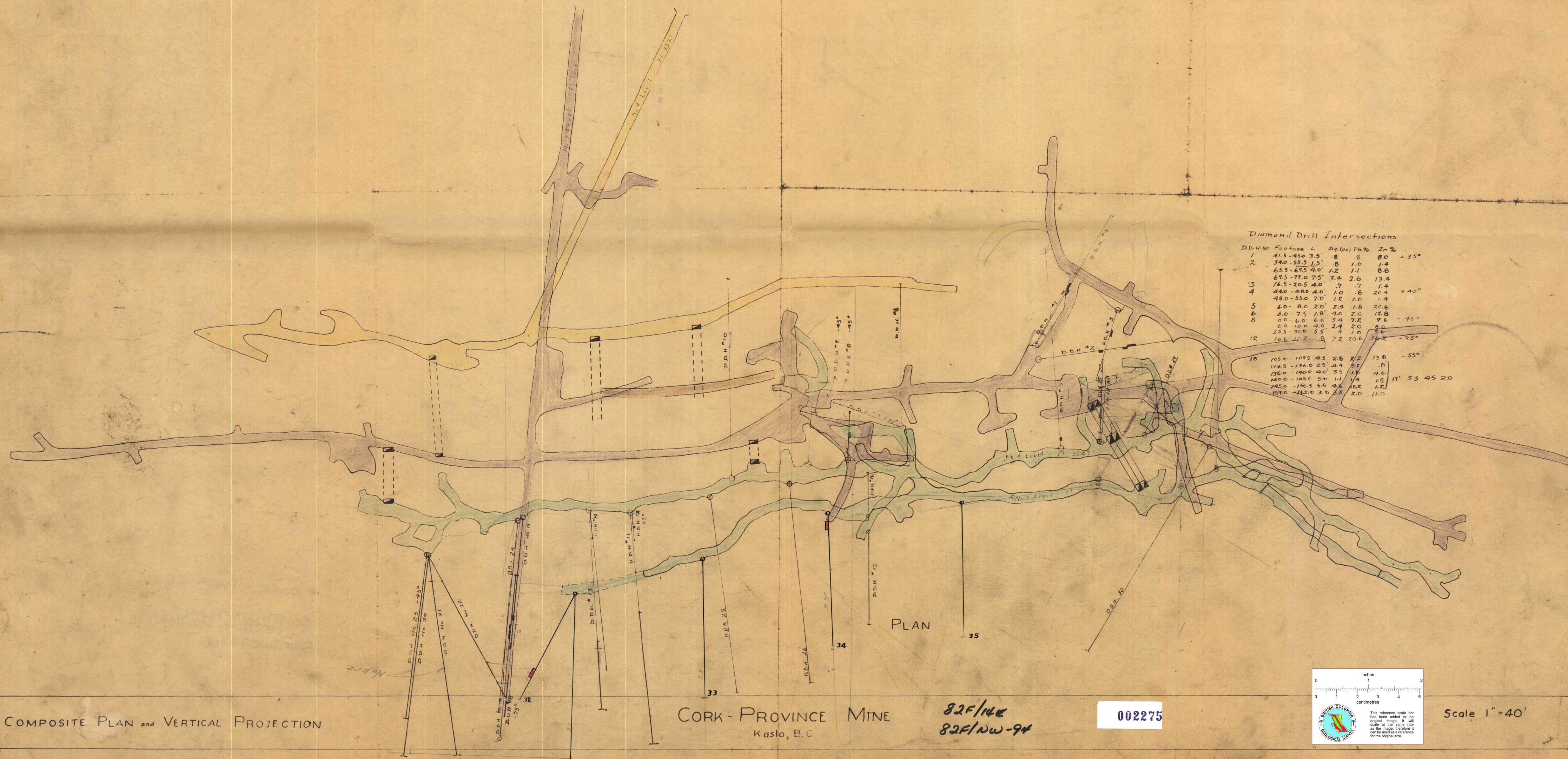
Diamond Drill Intersections