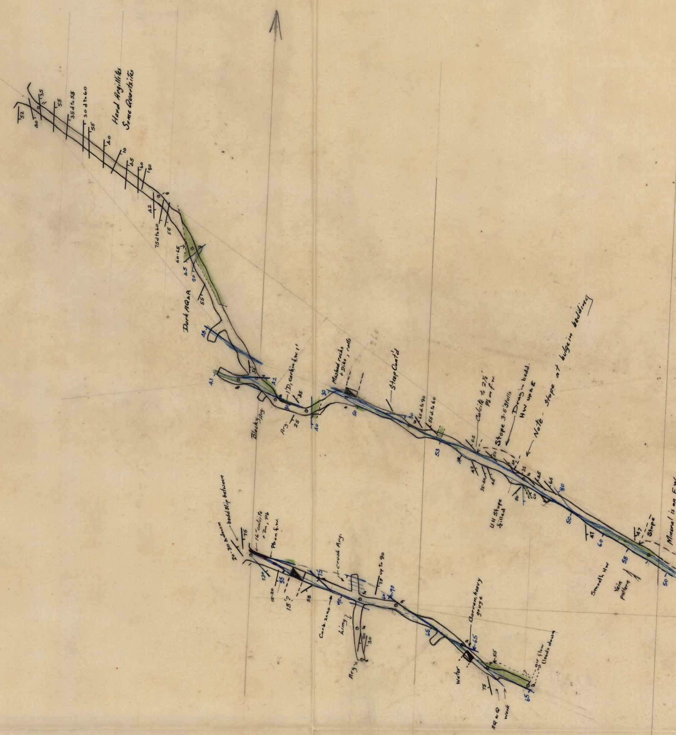
GEOLOGICAL PLAN — SUNSHINE LEVELS — WILD GOOSE BASIN Scale 1 in. = 400 ft. Surveyed July 1946.