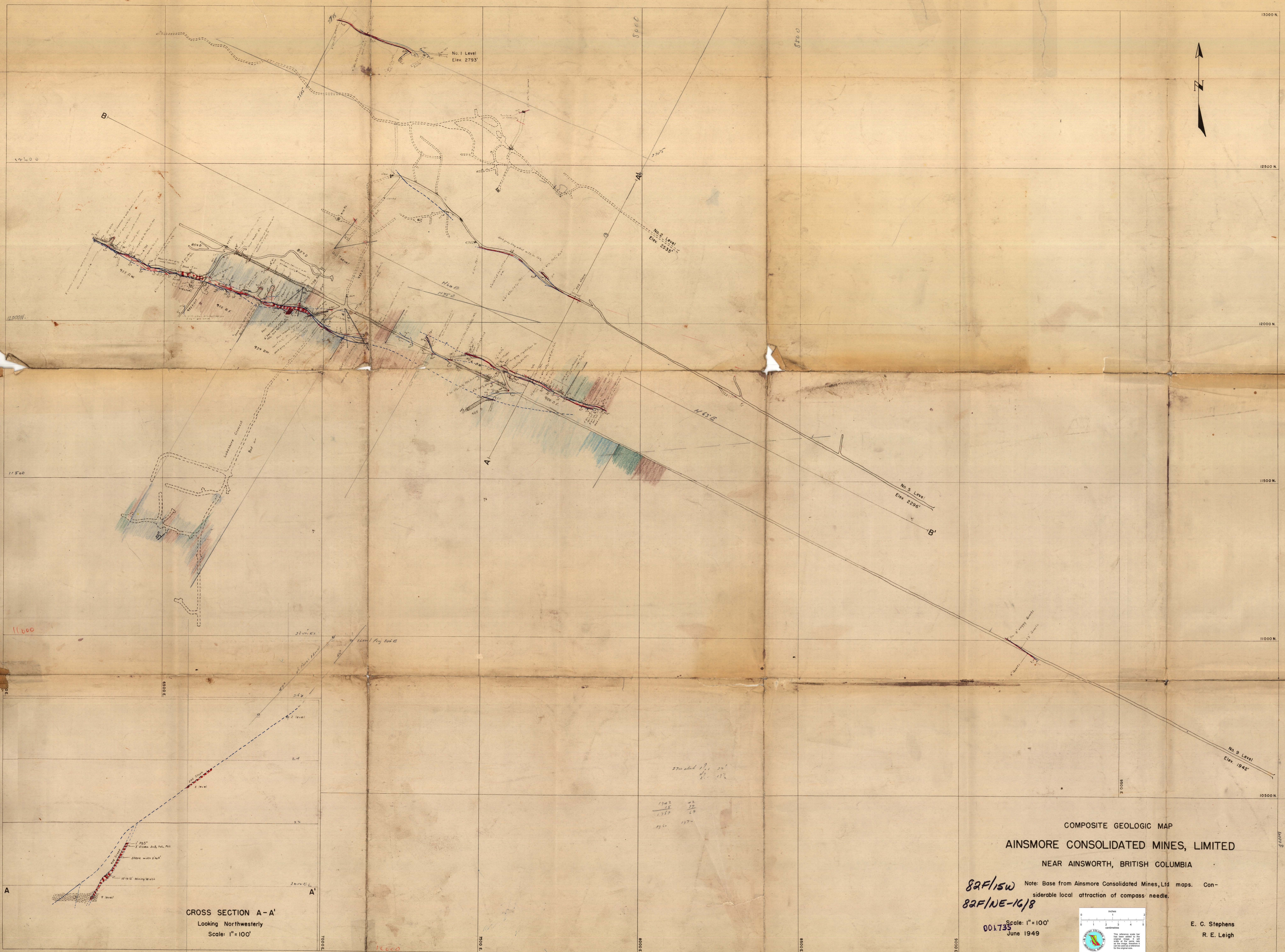
CROSS SECTION A-A' Looking Northwesterly Scale: 1" = 100'