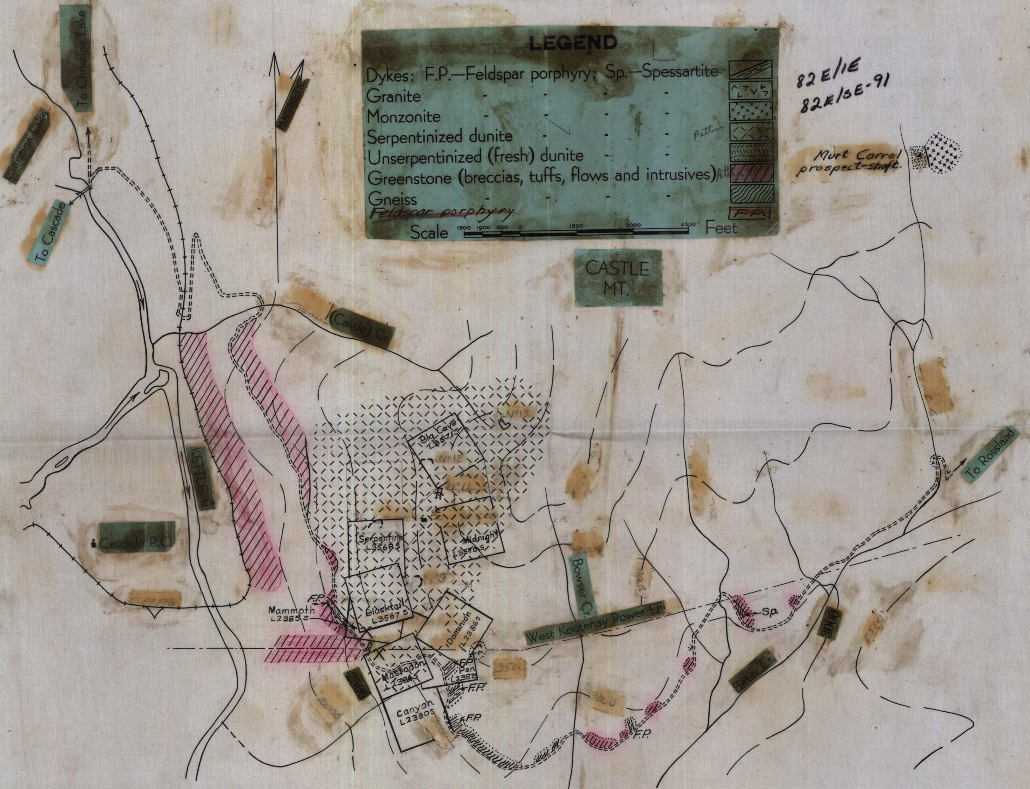
Fig. — Chromite deposits, S.W. slope of Castle Mt., Cascade. J. J. Stevenson Spring 1941.